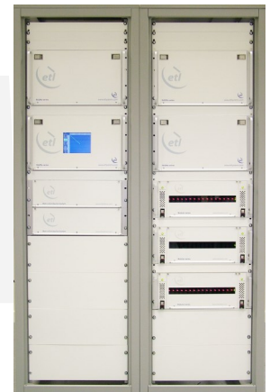
64 x 64 Enigma system with splitters & combiners