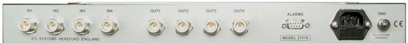
Rear View of Model M0404D1UFL-21119-N5N5

The compact and lightweight design also favours this use. The human interface is simpler than standard ETL matrices, but still fully effective and helps to optimise costs. There is only local control of the routing.