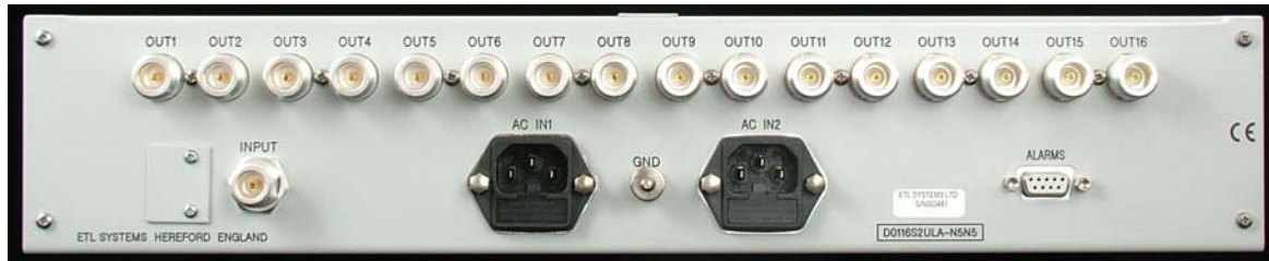
FIG.1 Rear of similar 16-way splitter with N-type connectors