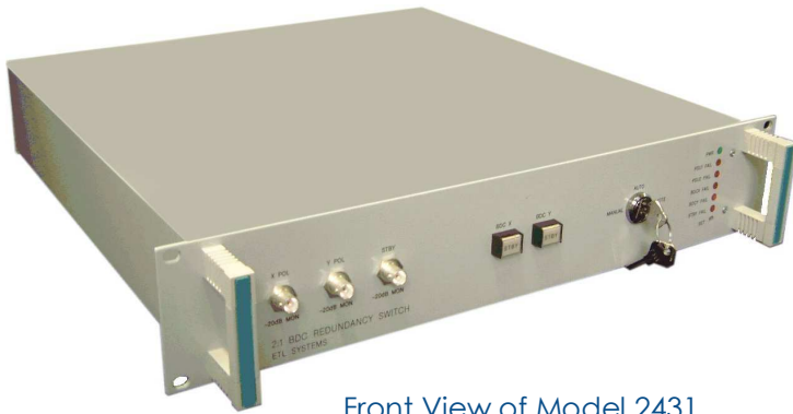
Front View of Model 2431

With 2:1 redundancy switching and Swedish Microwave BDC Module