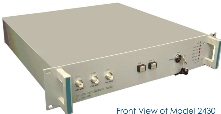
Front View of Model 2430

With 2:1 redundancy switching and Swedish Microwave BDC Module