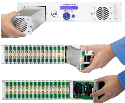
Indoor chassis showing hot-swap power supply modules, fibre modules and fans

Local control & monitoring via front panel push buttons & display