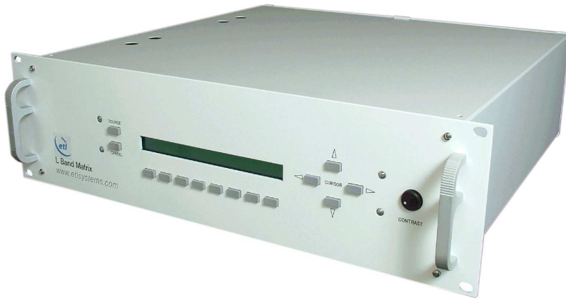
Front View of Model M1616D3UFB-B5B5-A

With Local & Remote Control (via RJ45 Ethernet Port & RS232/422/485 Serial Port)