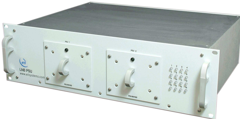
Front View of Model 2745A-F7F7

With current monitoring (via RS232 serial port)