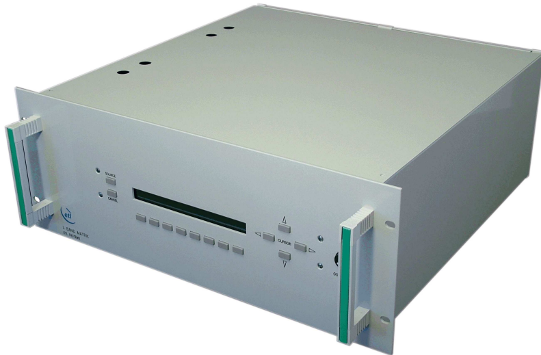
Front View of Model M0824D4UFL-F7F7

With local and remote control (via RS232/422/485 Serial Port) Designed for ships