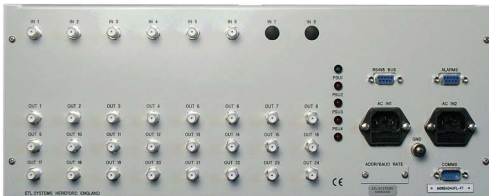
Rear View of Model M0824D4UFL with 75 ohm F-type connectors

Offering the matrix in a single unit enhances RF performance, reduces cost and is faster to install than traditional solutions.