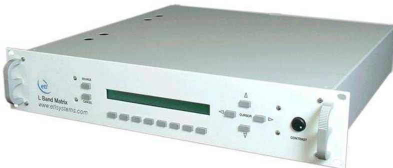
Front View of Model M0808D2UFL-B5B5

With Local & Remote Control (via RS232/422/485 Serial Port)