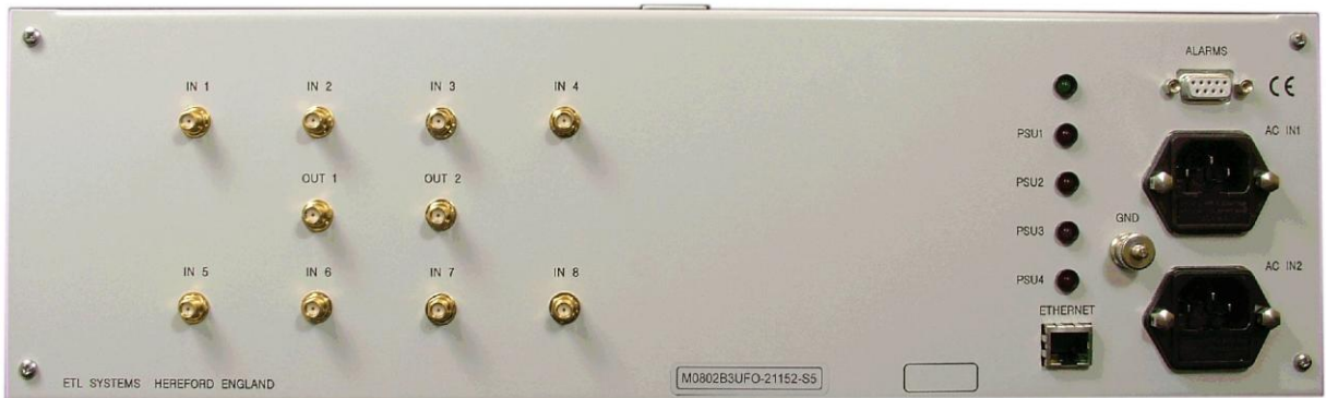
Rear View of Model M082B3UFO-21152-S5

The matrix incorporates a standard ETL controller which can be remotely controlled via a PC (using ETL software) or integrated into an M & C system. This passive matrix allows any input to be routed to any output and utilises latching, self terminating coaxial relays/multi-switches with isolation (minimum 60 dB at 18 GHz), and an expected operating life of 106 cycles.