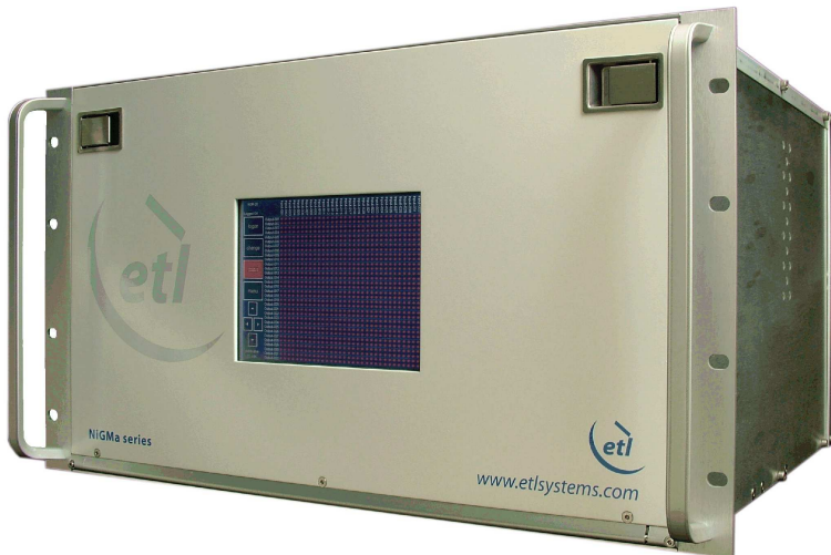
Front View of Model NGM-29 showing touchscreen VGA

ETL's popular high performance NiGMa Broadband distributive matrix evolves to set new benchmarks for RF performance and leading edge technologies.