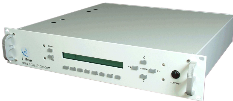
Front view of Model M0808D2UFI-B7B7-A

With Local & Remote Control (via RJ45 Ethernet Port and RS232/422/485 Serial Port)