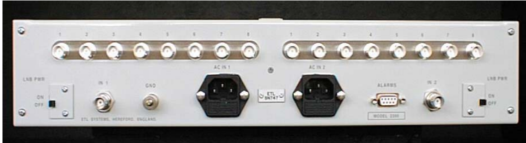
Photo of similar 2U dual 8-way splitter with BNC connectors