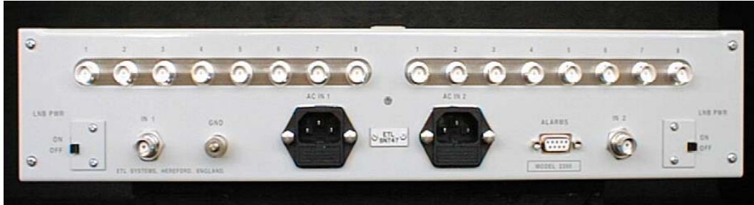
Photo of similar 2U dual 8-way splitter with BNC connectors and LNB powering