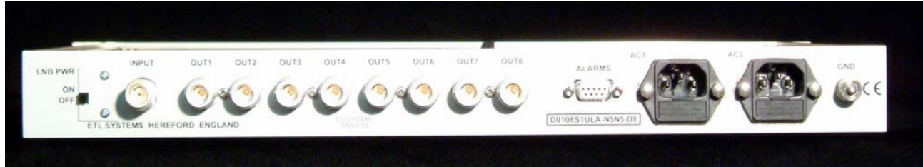
Photo of rear panel of D0108S1ULA-N5N5-D8