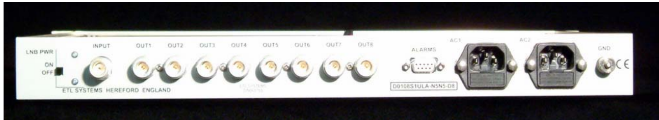
Photo of rear panel of similar 8 way splitter