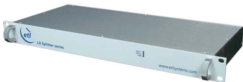
Front view of LD Series Splitter

This compact 8-way active splitter is designed to provide affordable L-band splitting in a 1U chassis. Covering the full range of L-band, 850-2150MHz, this shelf also offers dual redundant power supplies, and is also able to provide switchable LNB powering.