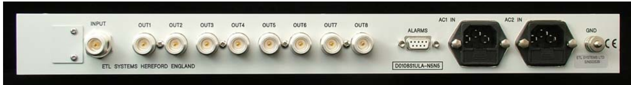
Photo of rear panel of similar 8 way splitter with N-type connectors