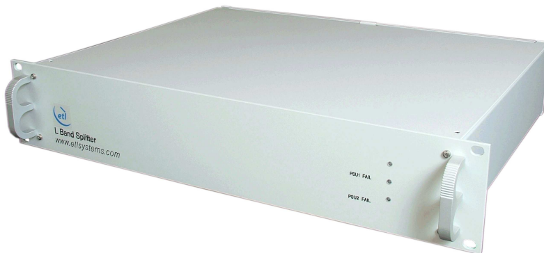
Front view of Model D0104Q2ULA-N5N5-D8

This splitter shelf contains 4 of ETL's 4-way active equalised splitter modules, housed in a 2U shelf. This unit benefits from dual redundant power supplies for reliability in service. Front panel LEDs provide a visual status for the power supplies, and monitoring can also be done via a dry contact alarm port on the rear panel.