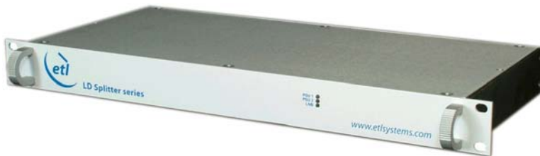
Front view of LD Series Splitter

This compact 4-way active splitter is designed to provide affordable L-band splitting in a 1U chassis. Covering the full range of L-band, 850-2150MHz, this shelf also offers dual redundant power supplies, and is also able to provide switchable LNB powering.