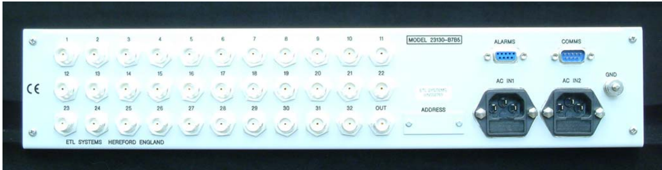
Fig. 2 – 2U model 23130 32x1 switch – rear view showing serial port for remote control.