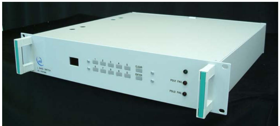
Fig. 1 – 2U model 23130 32x1 switch shelf with integrated controller and RS232 / 485 remote control.