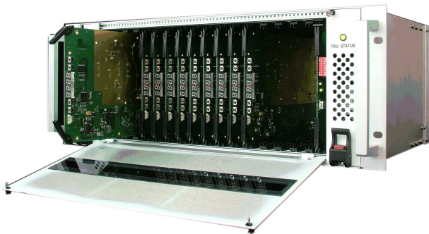
Front view showing hot-swap RF Module