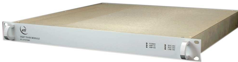
Front View of Model 22253-N5N5-E

With LNB Powering, BUC Powering & 10MHz Source