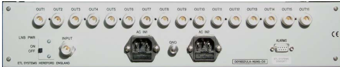
FIG.1 Rear of similar 16 way splitter with N-type connectors