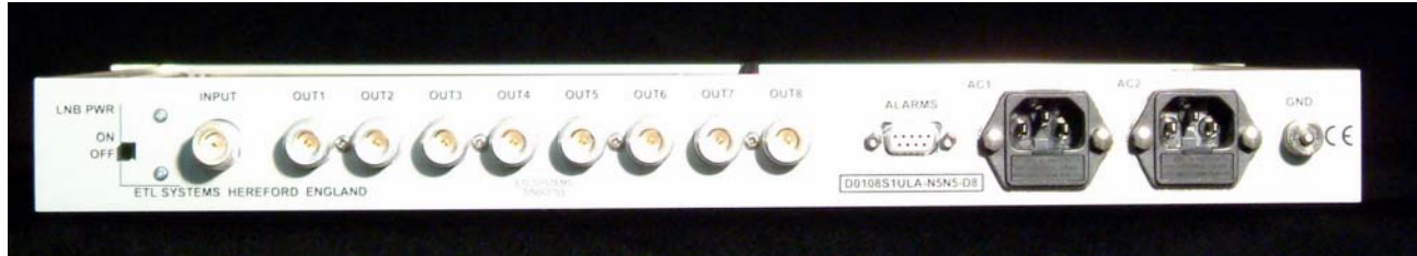
Photo of rear panel of similar 8 way splitter