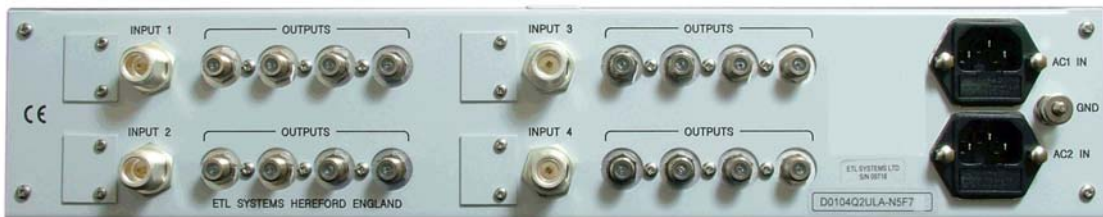
Rear view of similar Quad 4-way L-band Splitter

The power divider is available in a variety of 75 and 50 ohm impedances and connector types (model numbers will vary) and with single or dual power supplies.