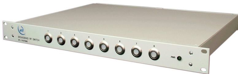
Front View of Model 23127-S5S5

With Local & Remote Control (Via RJ45 Ethernet Port)