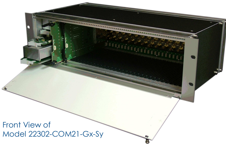
Front View of Model 22302-COM21-Gx-Sy

With hot-swap CPU, dual redundant power supplies & RF Modules