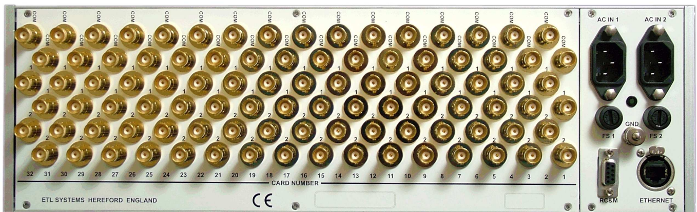
Rear View of Model 22302-DIV21-Gx-Sy

Remote Monitoring of the system can be done via the serial and Ethernet ports on the rear panel. This unit also includes Web Browser Interface as standard. Each RF module has an LED which provides simple local status monitoring.