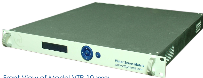
Front View of Model VTR-10-xxxx

ETL's new Victor Series of IF through L-band matrices, operate over the 50-2150MHz frequency range and provide a full fan-out high performance 16x16 matrix with local and remote control in a very compact form factor .