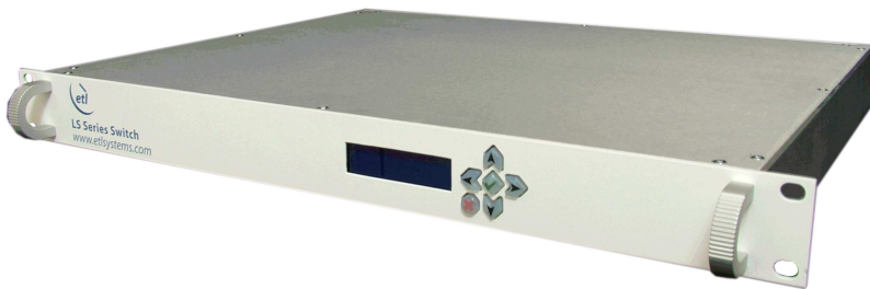
Front View of Model 23179-B5B5

With Local & Remote Control (Via RS232/422/485 and RJ45 Ports)