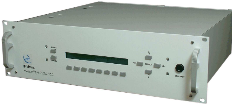
Front View of Model M1616D3UFI-S5

With Local & Remote Control (via RS232/422/485 Serial Port)