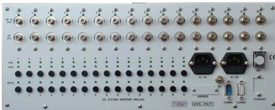
Rear view of similar 16 port LNB Power Supply

The unit also includes LNB current monitoring via the Ethernet port on the rear panel. The front panel tri-colour LED's give a visual status display.