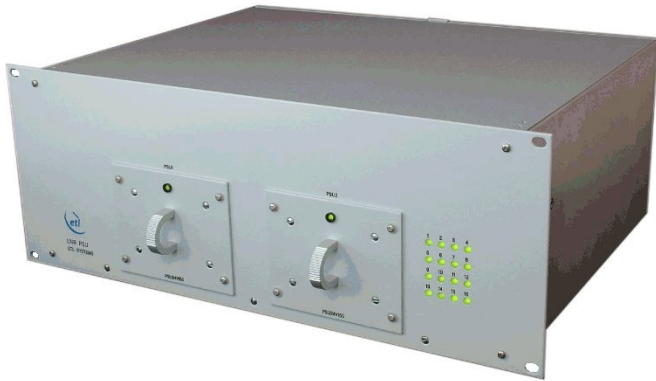
Front view of 16 port LNB Power Supply

With switchable 13/18V & 22KHz tone and Ethernet Monitoring & Control