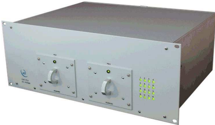
Front View of Model 2764-B5B5-E

With switchable 13/18V & 22KHz tone & current monitoring (via RJ45 Ethernet Port)